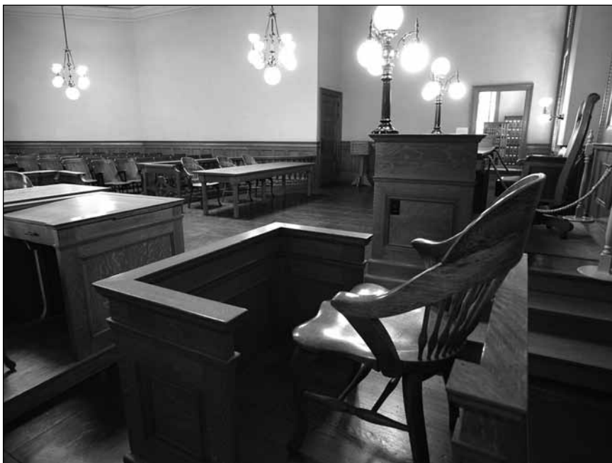
Sitting in the witness' chair and at the defendant's table in a courtroom is one of the possible outcomes of being involved in a self-defense shooting.

These are only some of the reasons gun owners must understand when it is justifiable to use deadly force in self defense, as well as learning what to expect from the legal system if they are left with no viable alternatives and must shoot an attacker.